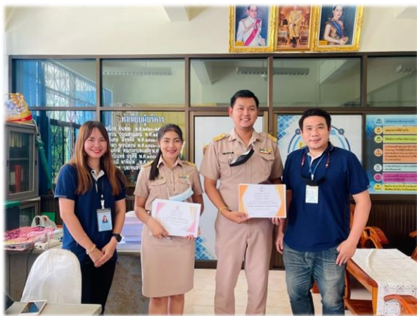
Nam Suay Wittaya School