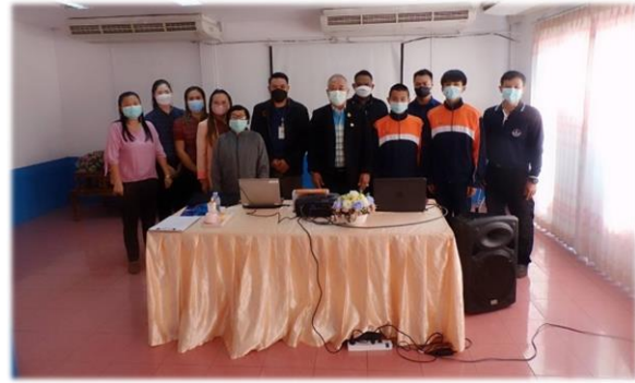
Observation and Protection Center for Children and Youth, Nong Khai Province