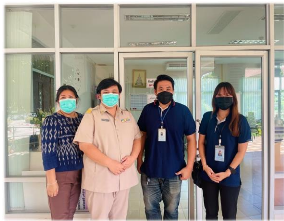
Children's and family home