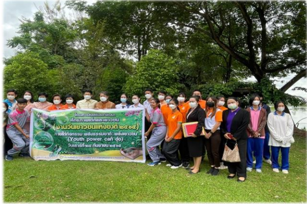
Participating in the National Youth Day Organized by Nong Khai Children's and Family Home Children's Agency Associates .The provincial governor presided over the ceremony.